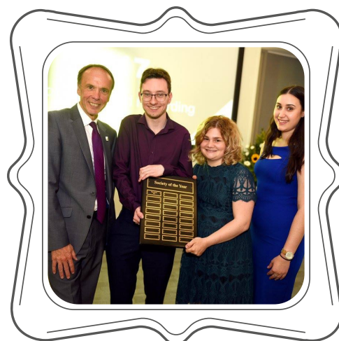
Winners of 2016/17 Film Society 993 Points

To see a detailed breakdown of the rewards scheme, speak to a member of staff from the SU.